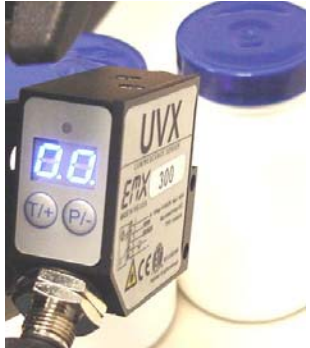
Tamper seal present Tamper seal missing