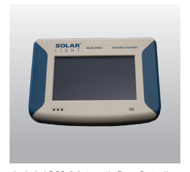
Included DCS-2 Automatic Dose Controller