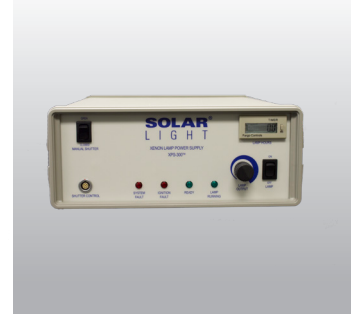
Included XPS-300 Xenon Lamp Power Supply