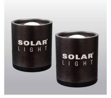
Included NIST-Traceable SUV & UVA Sensors